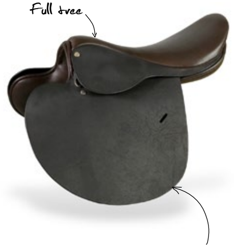
Full prain leather